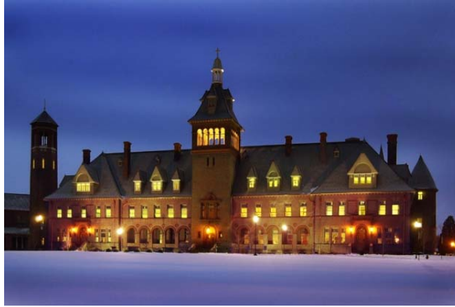
Main Administration Building of the College