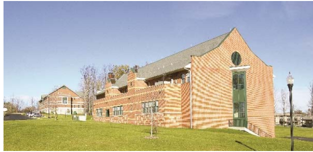
Pierce Health and Science Hall

Pierce Health and Science Hall, shown above, houses all laboratory science courses, and certain allied health programs. The facility boasts state-of-the-art instructional resources and, as renovated with proceeds of the 2016 Bonds, will permit Mount Aloysius to continue educating health and science professionals well into the future. Pierce Hall is also to be renamed the Learning Center for Health, Science and Technology.