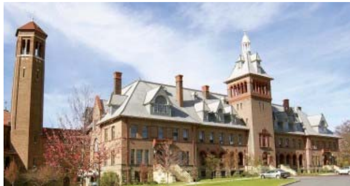
The Main Administration Building

Eleven buildings comprise the administrative, academic, and residential areas of the College's 193-acre campus.